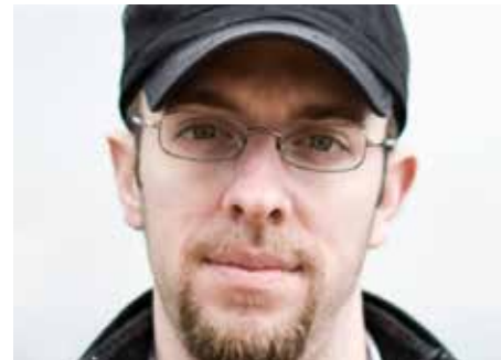
TALAL JABARI CINEMATOGRAPHER