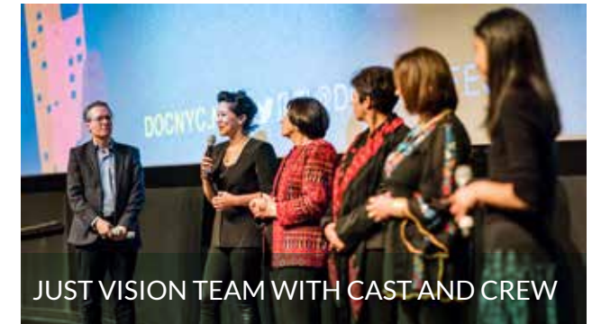
JUST VISION TEAM WITH CAST AND CREW