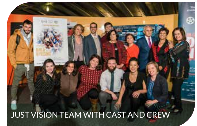
JUST VISION TEAM WITH CAST AND CREW